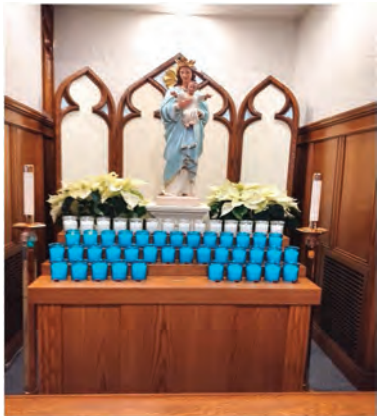
VOTIVE CANDLE STAND

The parish office is open 9am to 4pm Monday through Thursday and 9am to 12:30 on Friday.