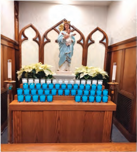
VOTIVE CANDLE STAND

The parish office is open 9am to 4pm Monday through Thursday and 9am to 12:30 on Friday.