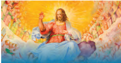
OUR LORD JESUS CHRIST, KING OF THE UNIVERSE