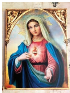
June 17, The Immaculate Heart of Mary The Immaculate Heart of Mary was filled with love for Jesus.