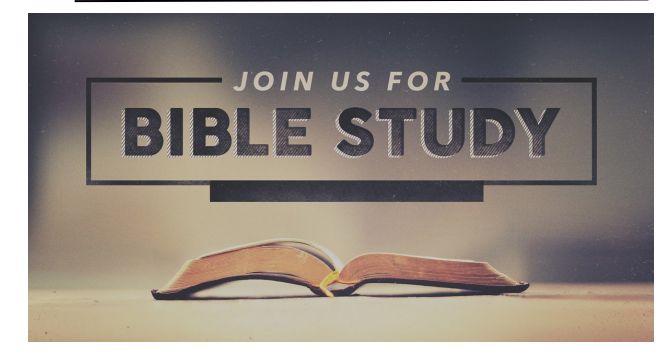
St. FRANCIS BIBLE STUDY TO RESUME: SEPTEMBER 10 St. Francis Bible Study will resume this Tuesday, September 10, 2019. They will meet from 6:30pm to 8pm. The topic of study is Romans.

Monday, September 9 6:30pm Ministry Weekend Meeting w/ Leaders (HBH) Tuesday, September 10 6:30pm Bible Study (↓FGC) 7:00pm Choir Rehearsal (Church Loft) Thursday, September 12 9-10:30am Parish Staff Meeting ( Office closed during this time ) 6:00pm Opening the Word (FGC) 7:00pm Men of St. Joseph (FGC)